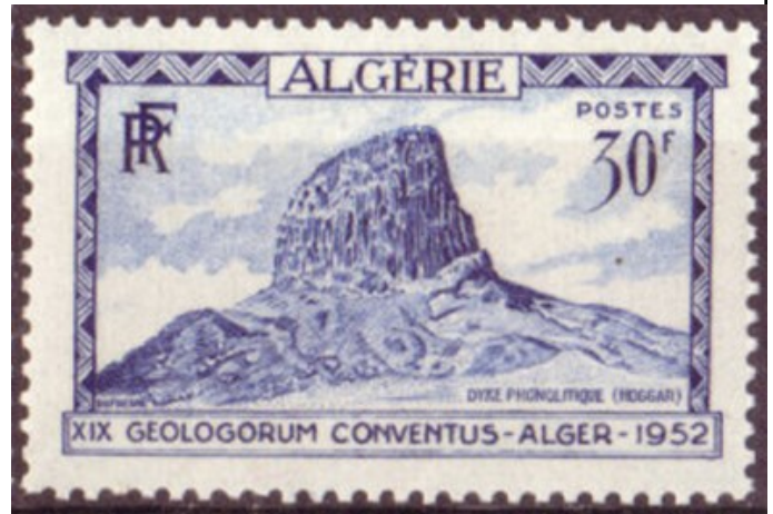
The companion stamp to the set.

Check out the Mollusks on Postage Stamps facebook page.