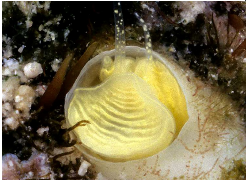
Cayo margarita 's shell opening (diameter: 3.5 mm) and "face" with foot disk and extended tentacles. From the original report in PeerJ.